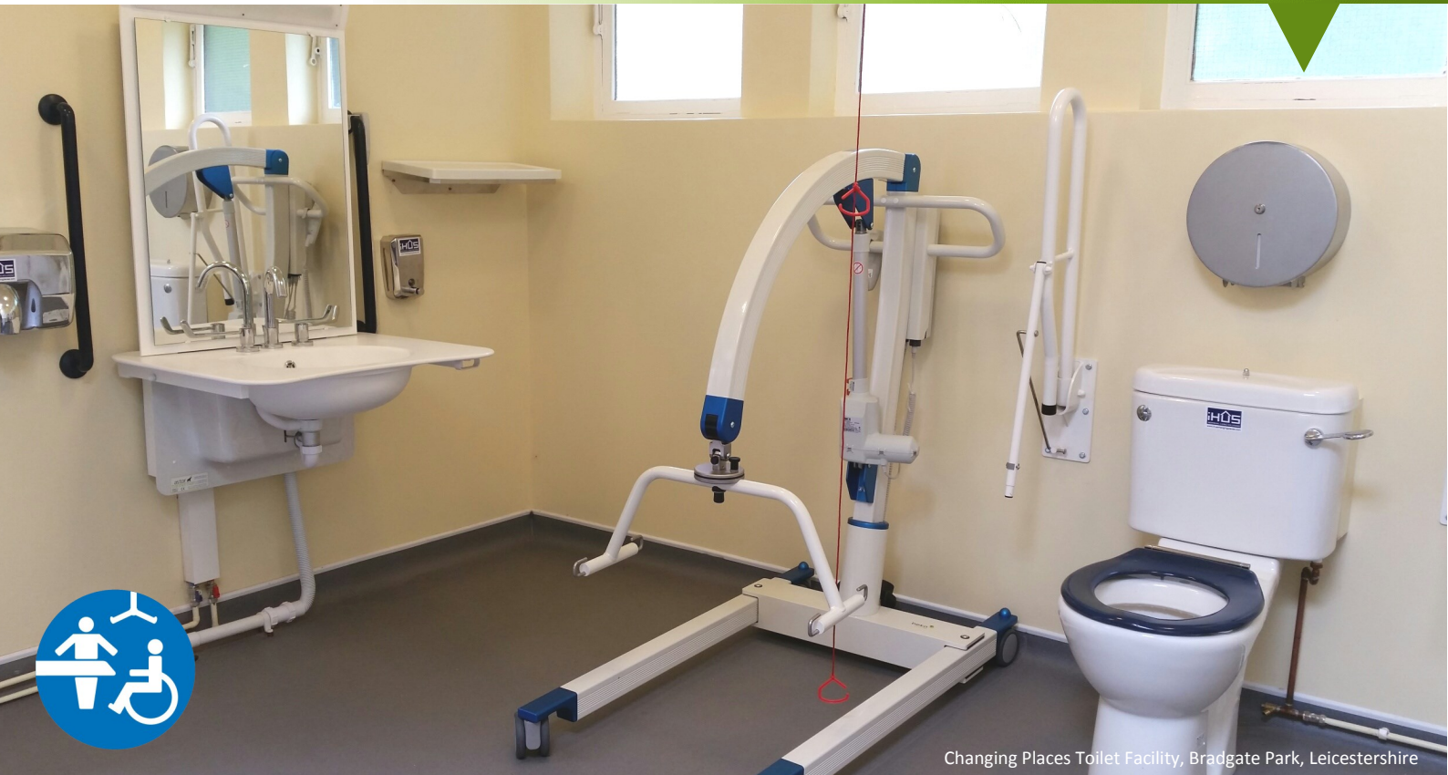
Changing Places Toilet Facility, Bradgate Park, Leicestershire

Introducing an accessible Changing Places toilet means Bradgate Country Park in Leicestershire now offer full changing, hoisting and toileting facilities for disabled visitors and their families.